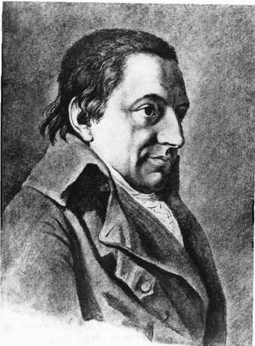
Johann Gottlieb Fichte