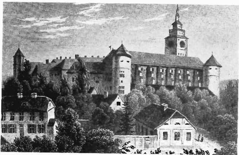
The castle and Kant's house