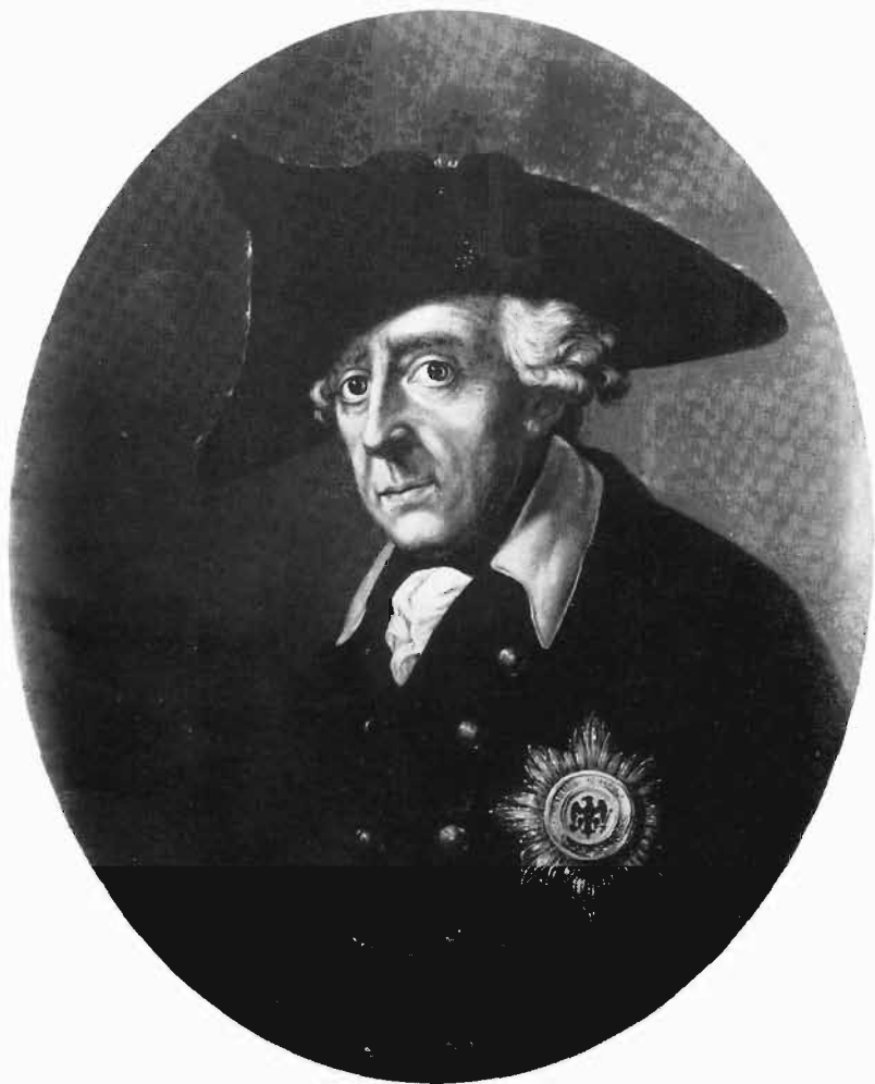
Frederick II or Frederick the Great