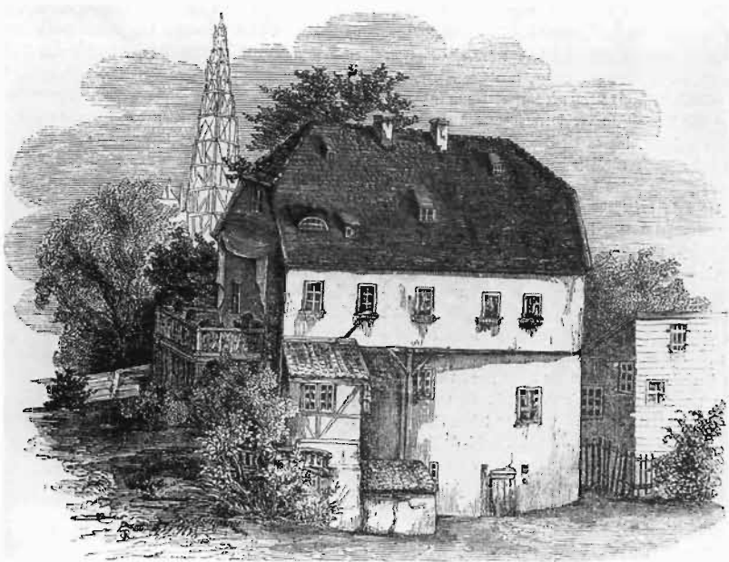
Kant's house