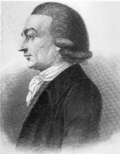
Johann Georg Hamann (Museum für Hamburgische Geschichte)