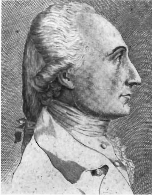
Friedrich Heinrich Jacobi (Schiller Nationalmuseum, Marbach)