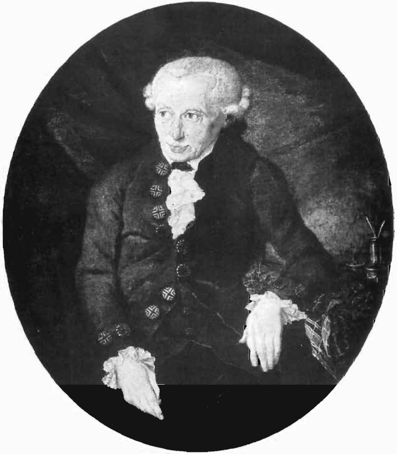
Immanuel Kant, 1791 (miniature by Gottlieb Doppler, 1791)