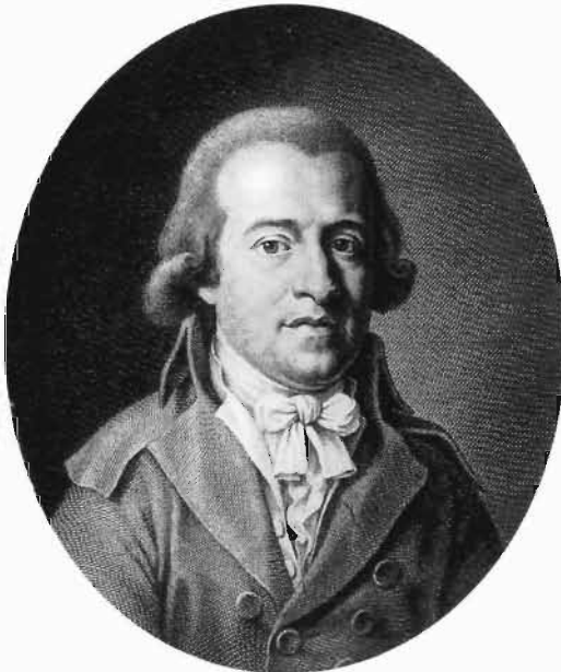
Karl Leonhard Reinhold