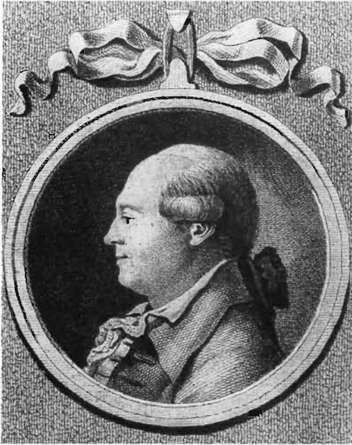
Karl Freiherr von Zedlitz, Prussian minister of education and supporter of Kant