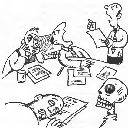
debating at length

If you don't spend much time on an issue, you touch on the issue . If you pay a lot of attention to an issue you: