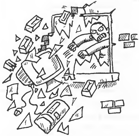
resizing a window