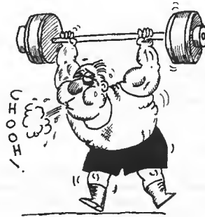
a heavy cold