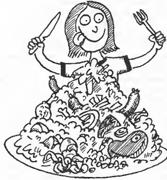
a substantial meal