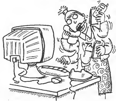
operating at full capacity

an advertising campaign an initiative an operation a product a programme a project a scheme a takeover bid