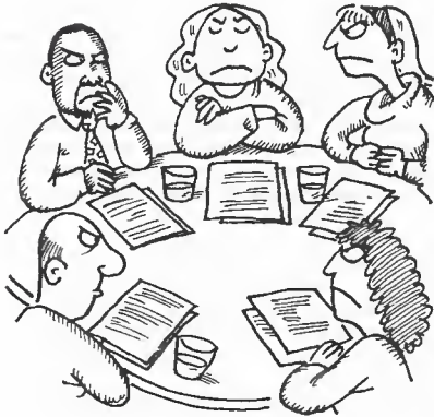
reaching a consensus