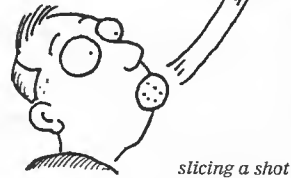
slicing a shot