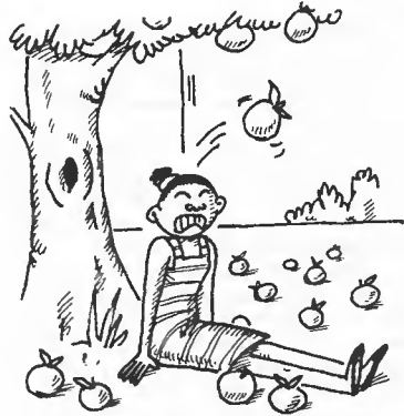
a bumper crop of apples