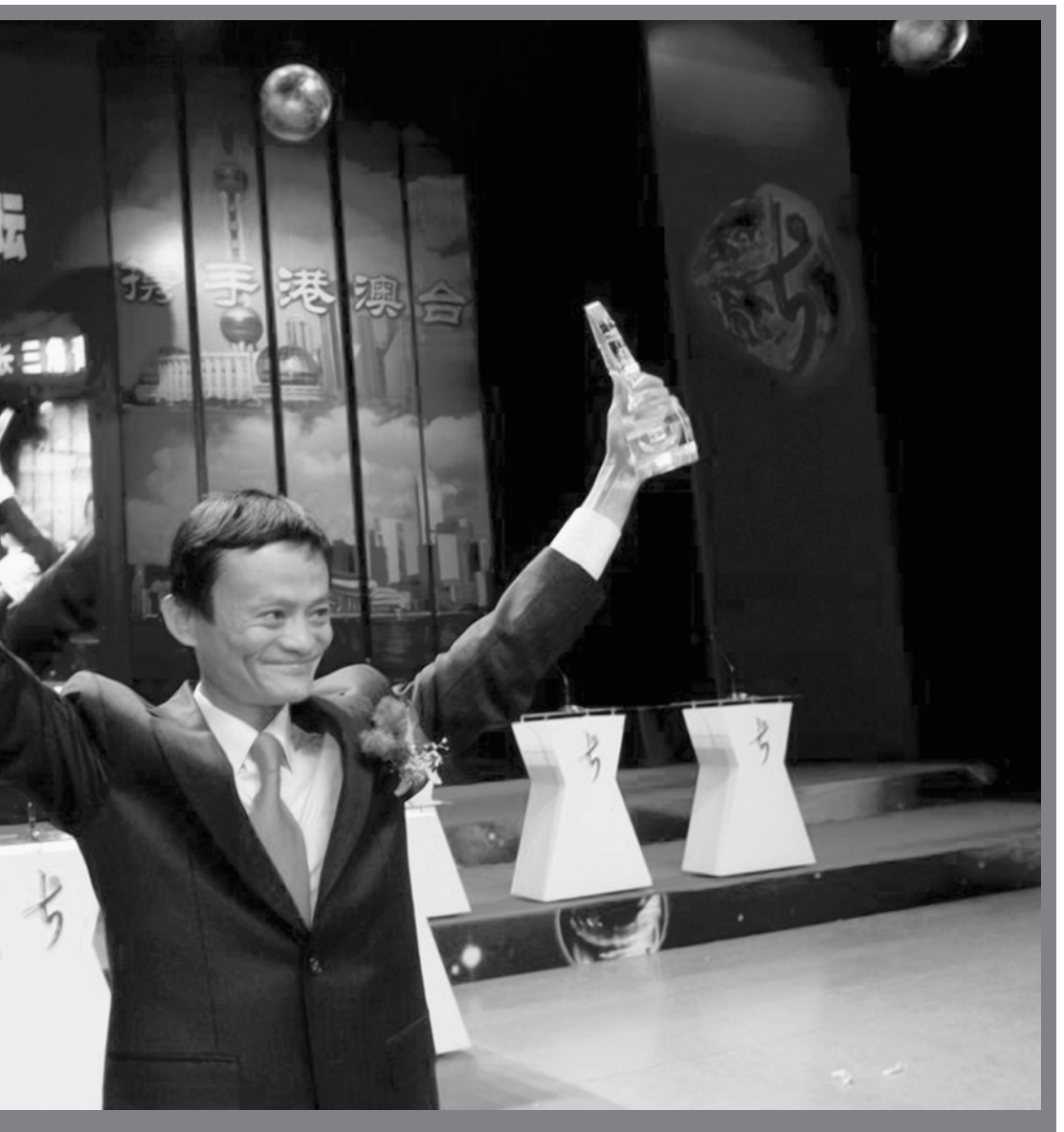
In 2006, Ma was honored with an award called the Yangzi River Delta Award. It recognizes entrepreneurial achievement and specifically awards the leadership of innovative young people.